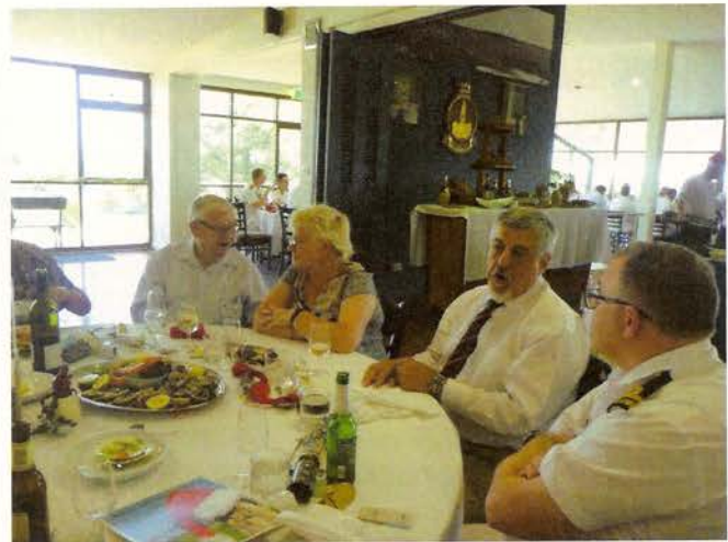
Some RAN members joined our table, which was great!