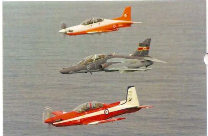
Top is PC-21 (in Singaporean colours); with the BAE Hawk in the middle and the current RAAF PC-9 at the bottom.

The new pilot training system will use the latest in simulator technology that can be adapted to student needs and different learning styles to allow students to progress through training faster.