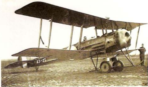
An AVRO 504K, in use in the 1920s at No 1 FTS

There is further change to SAW planned for February 2016 when the name of the Unit will change to No 1 Flying Training School. SAW will be 'dis-banded' on 19 Feb 16 and the unit renamed to No 1 Flying Training School. No 1 FTS was formed in 1921 on the formation of the RAAF and initially located at Point Cook. The unit closed on 31 January 1993 with the commercialisation of basic ADF pilot training.