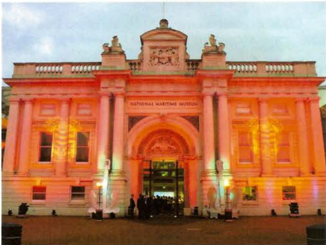
National Maritime Museum at Greenwich

The UK RIN 'History of Navigation' Conference is on in the UK, 9-10 June 2016. This Conference will consider the special demands of aeronautical navigation and will consider how marine navigation evolved into aeronautical navigation. The venue will be the National Maritime Museum at Greenwich.