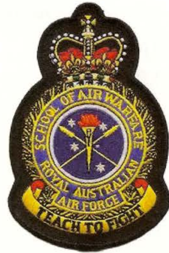
Badge of the School of Air Warfare

The Queens Colour was presented to the School of Air Navigation (and thus to its successor, School of Air Warfare) in 1978, at a parade at East Sale. On the same day and parade, the Queens Colours was also presented to Central Flying School.