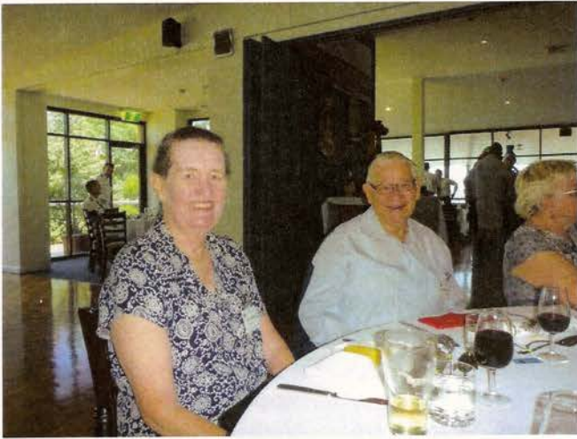
The Davidsons enjoying the festivities!